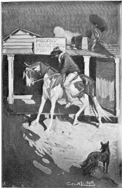
Stingaree knocked in vain.