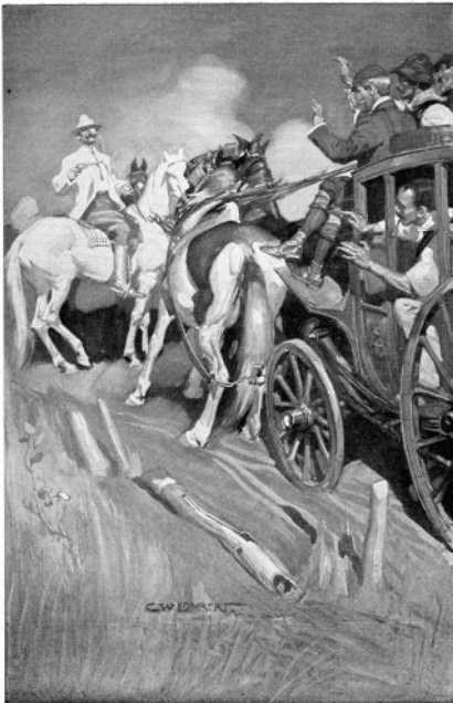
Mr. Kentish watched the little operation of "sticking up" without a word.

"So that's Stingaree!" he said, more to himself than to his comrades in humiliation; but the bushranger had cantered back into the scrub, and his name opened the flood-gates of a profanity which made Kentish wince, for all his knowledge of the world.