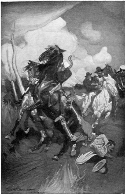
Stingaree toppled out of the saddle.

He was leading now with the kindly sergeant, and his mind had never been more alert. Behind them thundered the recalcitrant Howie with constable and Superintendent on either side. They were midway between Mazeppa and Clear Corner, or some fifteen miles from either haunt of men. Stingaree pulled himself upright in the saddle as